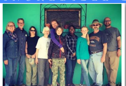
COLORADO TEAM 2017