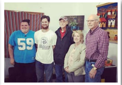
ICARD, NC TEAM 2017