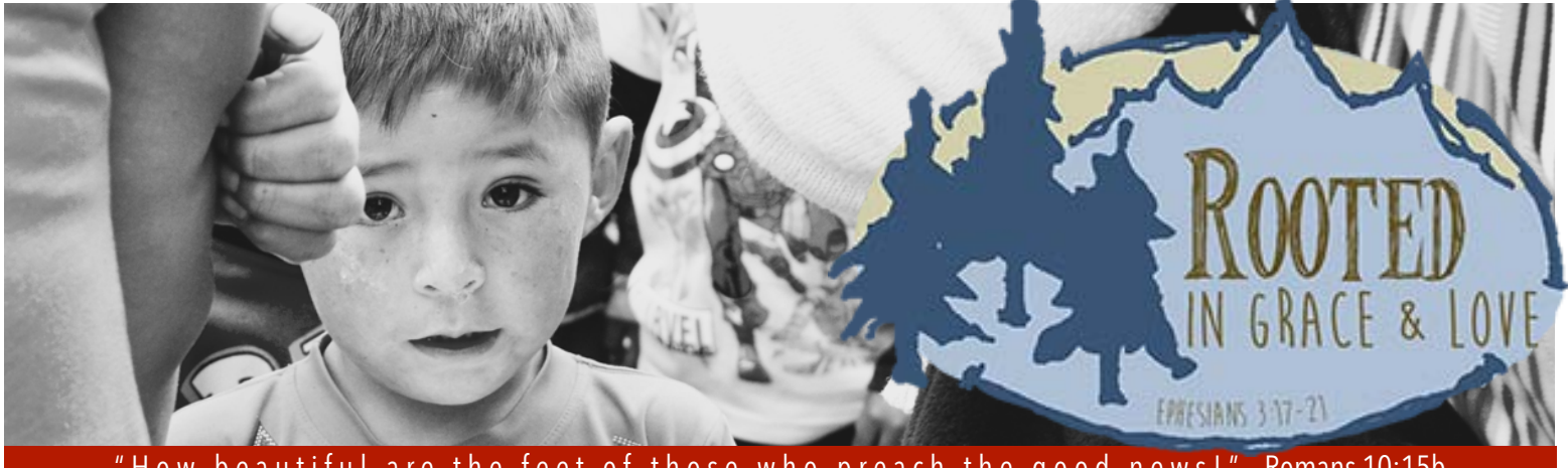
"How beautiful are the feet of those who preach the good news!" -Romans 10:15b