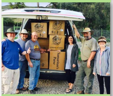
MT. VERNON BAPTIST NORTH CAROLINA TEAM 2017

ROOTED IN GRACE & LOVE, INC. WAS ESTABLISHED AS A 501(C)3 NON-PROFIT ORGANIZATION IN 2015