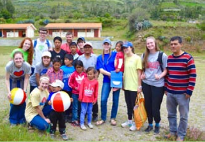
ARKANSAS: THE BAPTIST PREPARATORY SCHOOL TEAM 2017