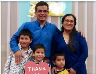
The Gamarra Family